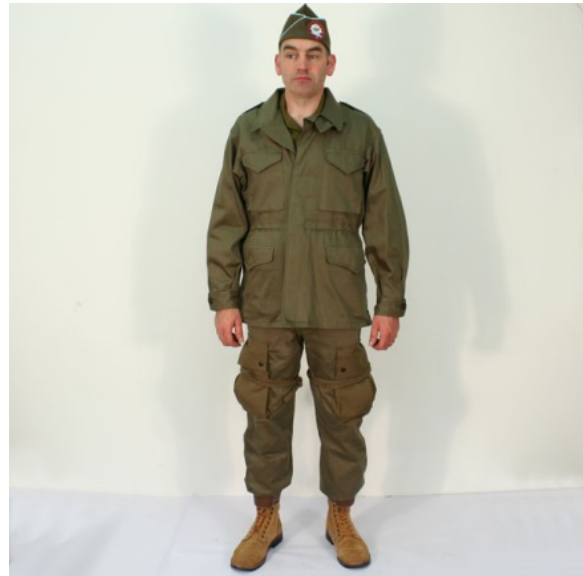
M43 Rigger modified uniform.