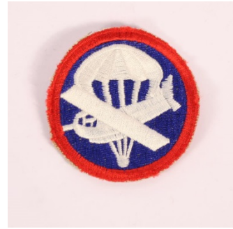
Mid / late war cap patch.