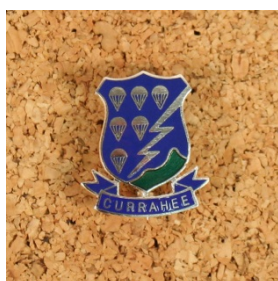
506 th Lapel Pin (x2)