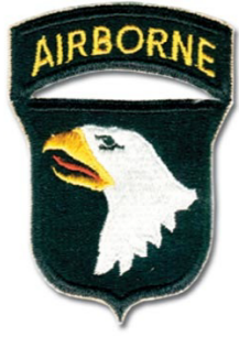
Correct 101 st patch.