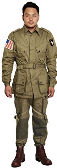
M42 Re-enforced Jump uniform.