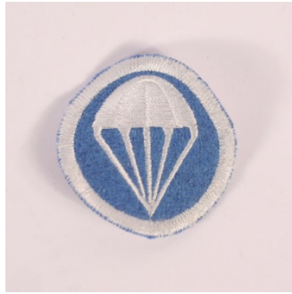
Early war cap patch.